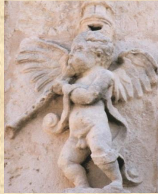
Musician angels. Renaissance facade of the St. Vicent Martir Church. Guadassuar (Valencia)